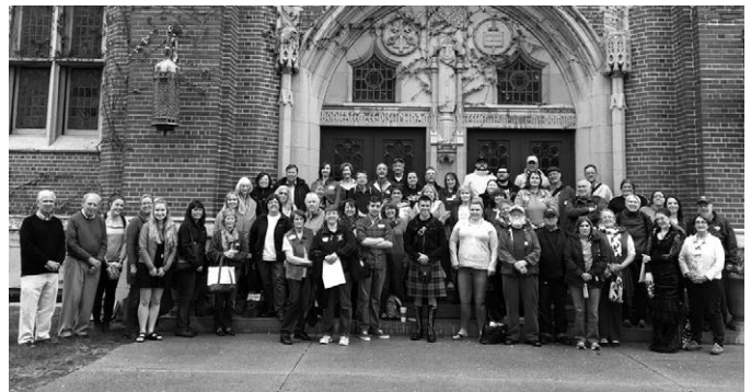
Our group of Irish language learners.

of the prayer. “Soisigh ár n-aighe chun urraim a thabhairt don oidhreacht uasal a thainig chugainn tríd an dteanga sin, agus neartaigh ár dtoil chun í a shlanú.” ( Enlighten our minds to give respect to the noble tradition that comes to us through that language and strengthen our will to preserve it. ) As in any other goal we set for ourselves, it takes time to master its complexities. Based on the enthusiasm of this group, there are many people heading in the right direction.