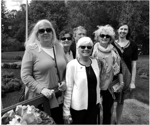
ICC Board members at the 1916 Gardens of Remembrance Ceremony.