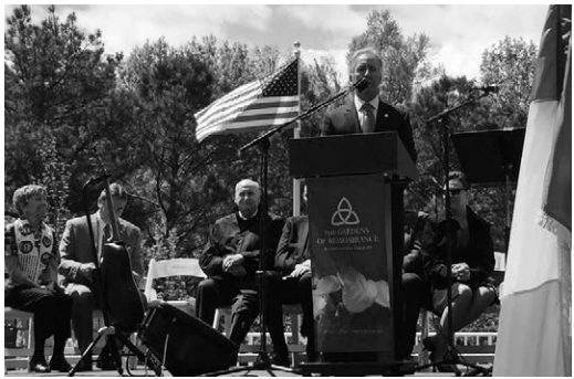
Congressman Richard Neal at the 1916 Gardens of Remembrance Ceremony at Forest Park in Springfield, MA on May 15, 2016.