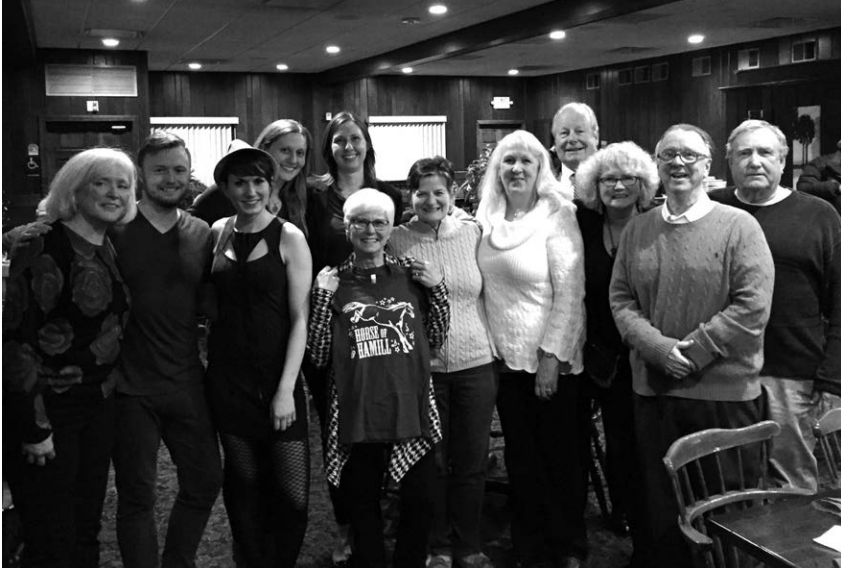
ICC Board and members with House of Hamill after their performance on February 20, 2016 at the Collegian Court in Chicopee, MA.