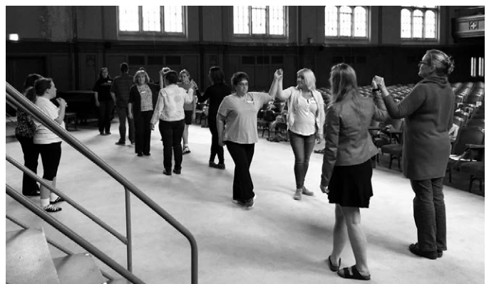
Participants learned some new dance steps.