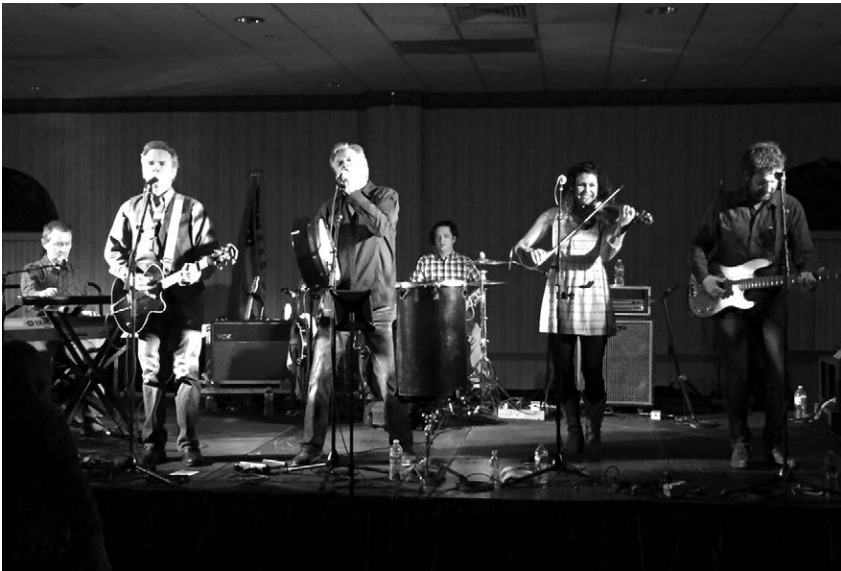
The Elders performed on April 9, 2016 at the Portuguese American Club in Chicopee, MA, to a very enthusiastic crowd.