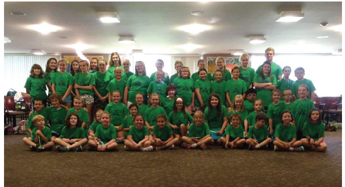
The campers enjoyed a week of learning about Irish culture.