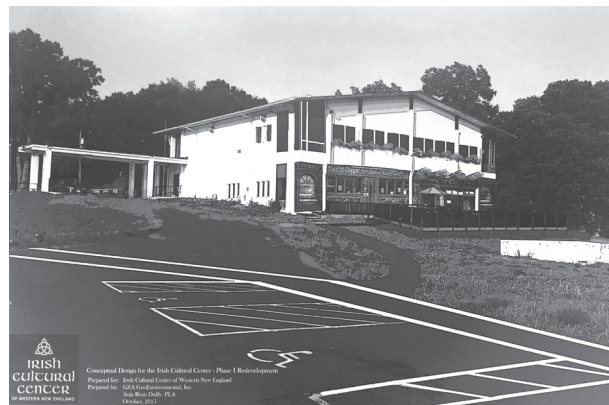
Design rendering of the refurbished ICC building