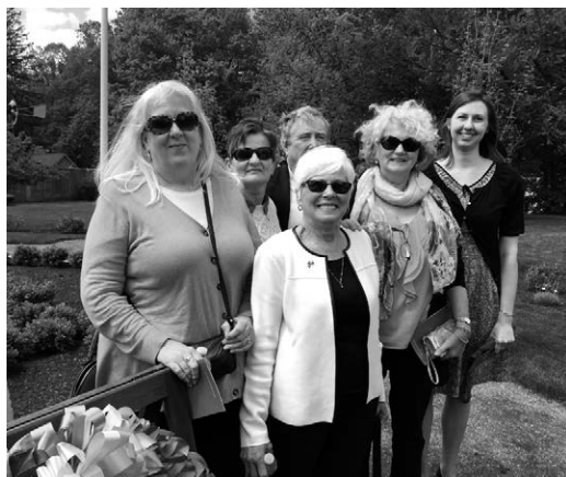
ICC Board members at the 1916 Gardens of Remembrance Ceremony.