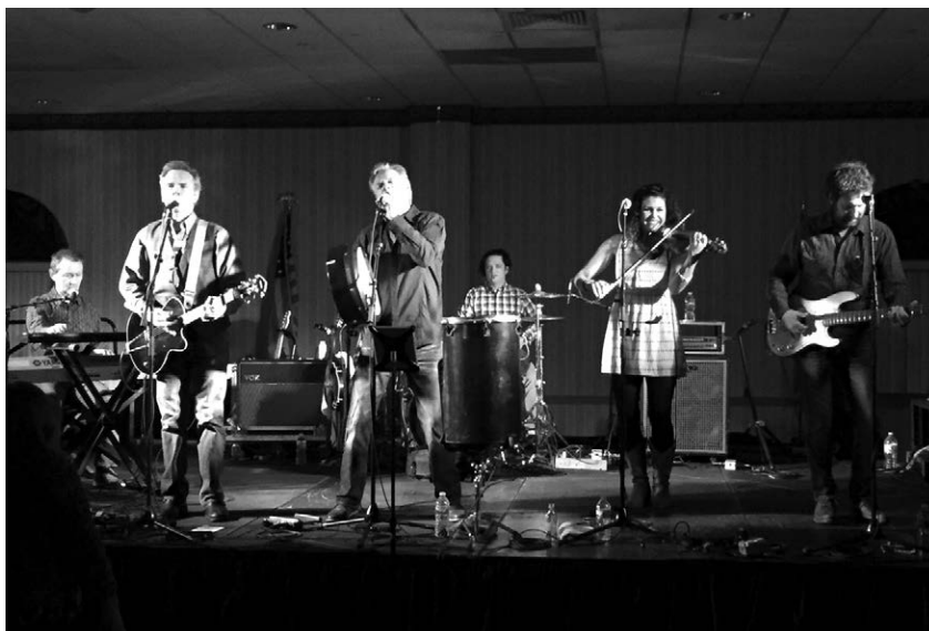
The Elders performed on April 9, 2016 at the Portuguese American Club in Chicopee, MA, to a very enthusiastic crowd.