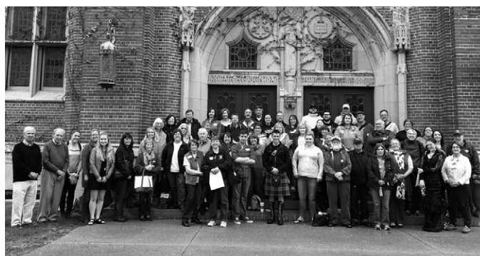
Our group of Irish language learners.

of the prayer. “Soisigh ár n-aighe chun urraim a thabhairt don oidhreacht uasal a thainig chugainn tríd an dteanga sin, agus neartaigh ár dtoil chun í a shlanú.” ( Enlighten our minds to give respect to the noble tradition that comes to us through that language and strengthen our will to preserve it. ) As in any other goal we set for ourselves, it takes time to master its complexities. Based on the enthusiasm of this group, there are many people heading in the right direction.