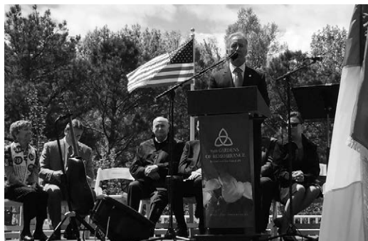
Congressman Richard Neal at the 1916 Gardens of Remembrance Ceremony at Forest Park in Springfield, MA on May 15, 2016.