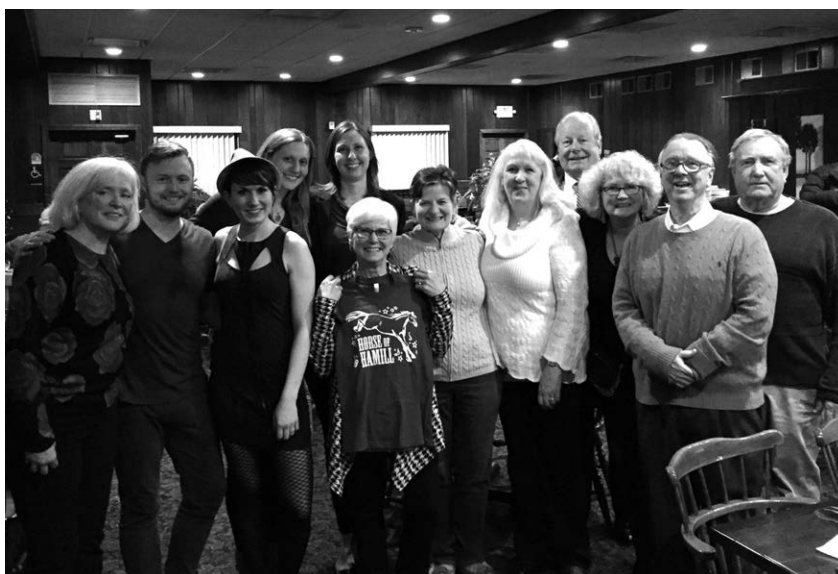
ICC Board and members with House of Hamill after their performance on February 20, 2016 at the Collegian Court in Chicopee, MA.