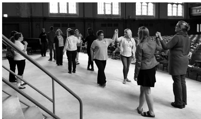
Participants learned some new dance steps.