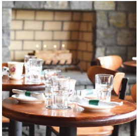
Table linens are also available for an additional fee. Cost of china and silverware is included in platter prices.

We have a full bar available, and are happy to discuss any options to suit your needs.