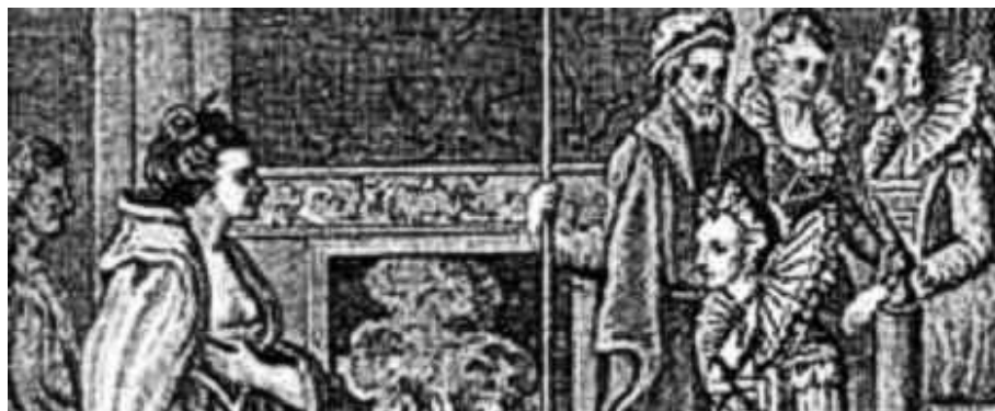
Gráinne O'Malley meeting Queen Elizabeth I in 1593.

The Céide Fields are the oldest known field systems in the world, over five and a half millennia old.